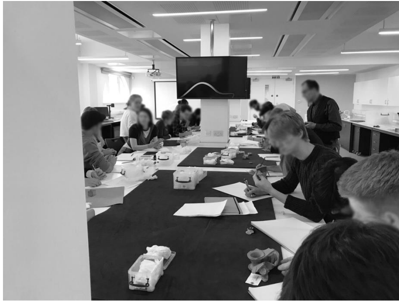
Figure 2. Students engaging with the Ways of Looking, Hunterian Handling Rooms