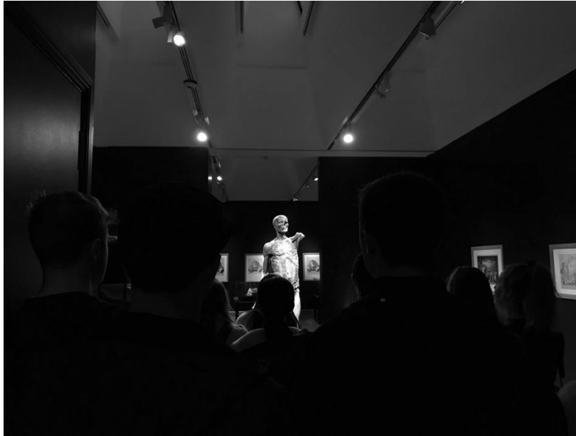
Figure 3. Students visiting The Anatomy of the Modern Museum Exhibition

The students were asked what the artefacts that they initially looked at for this brief would be in 2218? This did raise a valuable debate amongst the group as it is quite possible that the objects and experiences that they are responsible for in their careers as product design engineers will still have a place, and potentially, still be in use in 2218. An example of this that could be considered is the collection of Roman Artefacts in the Hunterian. Using this collection as inspiration, the students started to consider the idea of frontiers. Some product concepts started to explore what the frontier will be in 200 years' time? Will frontiers be physical, digital, or it may be another experience that has yet to be developed and defined? Due to the time constraints of the project, the students had to select one of the artefacts and then develop 3 concepts for their 2218 vision. These initial concepts were then presented at an interim stage, evaluated and then a chosen concept was selected to be developed further. The challenge with this future approach is that we do not have any answers, but at least we have access to a collection that displays and promotes how society, economy, ethics, medical science and communication have developed. Therefore, the Hunterian collection played a major role in the back casting of concepts and future scenarios.