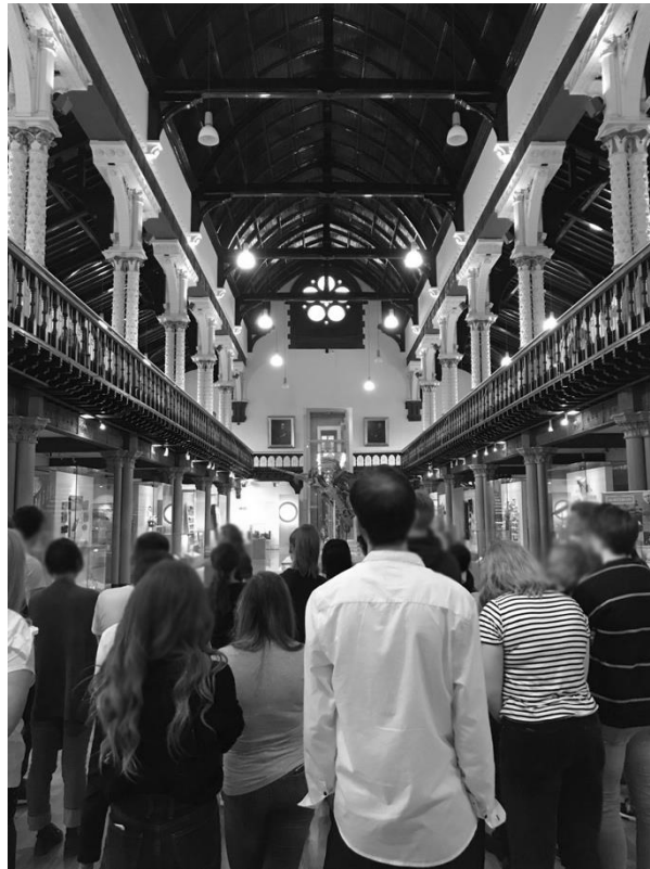
Figure 1. Students visiting the Hunterian Museum

experienced what The Hunterian has to offer. Not only would this project encourage access to the collection, it would also provide students with the opportunity to explore a major new exhibition at The Hunterian - William Hunter and the Anatomy of the Modern Museum. The exhibition celebrated Dr William Hunter's Tercentenary – 300 years since the birth of Hunterian founder. Therefore, accessing this collection was central to the project and how the artefacts would influence and inspire the 2218 future visions.