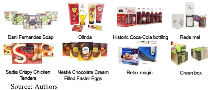
Figure 2. Packages selected for analysis