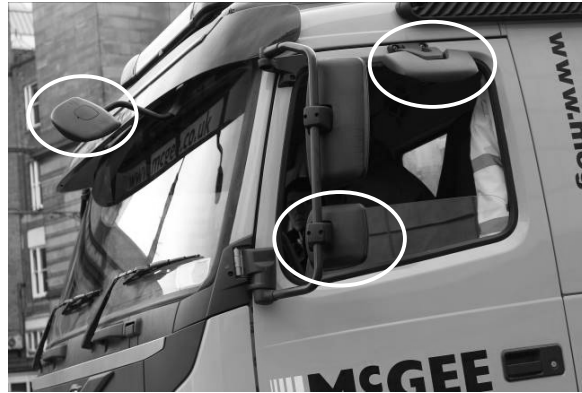
Figure 1. Image of additional mirrors

shown in figure 1. The Construction Logistics and Community Safety body (CLOC's) also recommend audible sensors and vision cameras to be utilised to eliminate or minimise blind spots as much as practically possible (CLOCS 2015). All these measures are already employed on McGee's fleet and whilst such methods improve visibility there are still limitations, particularly in identifying the blind spot for tipper drivers when turning left.