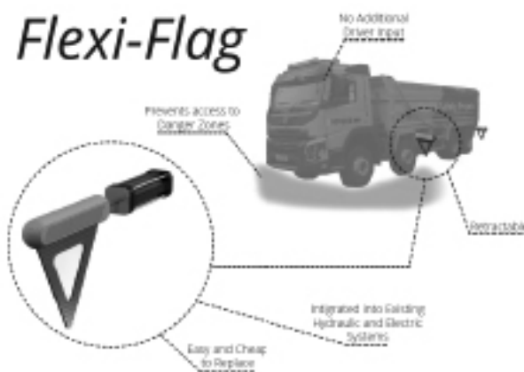
Figure 3. Winning Solution - Flexi-Flag

At the end of the 5 week project 12 student teams presented to a panel consisting of a Metropolitan Police officer from the cycle safety team and representatives from McGee including their Transport Manager, Marketing and Communications Manager, Health and Safety Director and Head of IT and Communications. These presentations by the students also formed part of their assessment for the project and included Q&A from the representatives. The students' presentations, presentation boards and feasibility reports were collated electronically and sent to McGee so that the owners could review the work and an exhibition of the work was put on for staff at their Headquarters. McGee then held a judging session within the company before deciding the winning teams. Initially McGee were planning to give the winning student team a prize of £2000 to share, however the owners were so impressed with the level of work produced that they decided to award additional cash prizes to the top 5 teams. The 1 st prize team were awarded £2000 for their 'Flexi-Flag' concept shown in figure 3. These students also share 50% of the patent and their solution has continued to be developed.