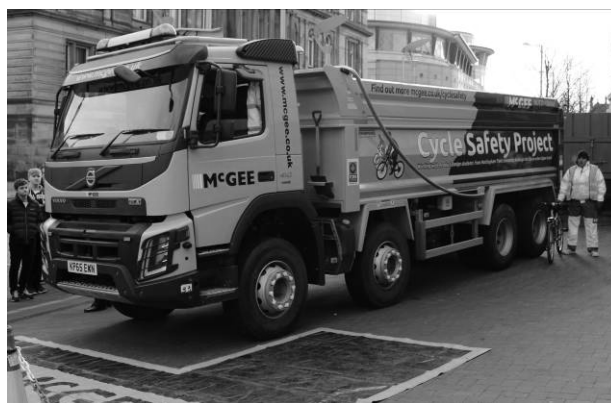
Figure 2. Exchanging Places Exercise

To launch the brief representatives from McGee and the Metropolitan Police delivered presentations outlining the above problem to students as well as the difficulty of developing a solution that is both road and construction site suitable. These presentations were interspersed with videos that demonstrated near miss scenarios and the extent of the blind spots on such vehicles. Following these introductions the brief was delivered. Students were taken outside to a new Volvo XF4 McGee tipper wrapped with vinyl promoting the partnership, see figure 2.