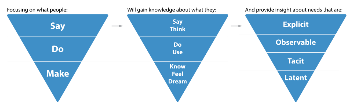
Figure 1. User involvement and insights based on what the users say, do, and make.

According to Sanders (2002) the type of user insight that can be obtained from user involvement depends on what the user is saying, doing or creating (see Figure 1).