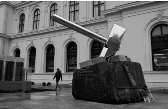
Figure 1. The debated memorial Smash Nazism, 2015, by Bjørn Melbye Gulliksen, with the mock up on the left and the final version on the right. The text on the monument says: 'It was worth fighting for freedom - for all countries, for all classes, for all people'—Asbjørn Sunde

The empirical data was gathered from a public memorial project, Smash Nazism (Figure 1), that sparked a huge debate in Norway on how a war monument in memory of a resistance group should be raised. The resistance group in question was very active during World War II and accomplished several of the most effective attacks against the German occupying forces including bank robberies to finance their activity, cracking and railway sabotage. Only after many years was initiative finally taken to erect a monument commemorating the team's efforts, and a competition was announced. The project was funded through unions, the National Rail and municipal authorities in Oslo. The jury was unanimous in its decision and chose a draft that matched well with the group's profile of the resistance's struggle using the title 'Smash Nazism'. After the jury declared Smash Nazism as the winner of the competition, a fierce debate began in Norway and abroad about the monument. A commercial mentor, Christian Ringnes, that donated a sculpture to the city of Oslo, located in the same square, initiated this debate (Figure 2).