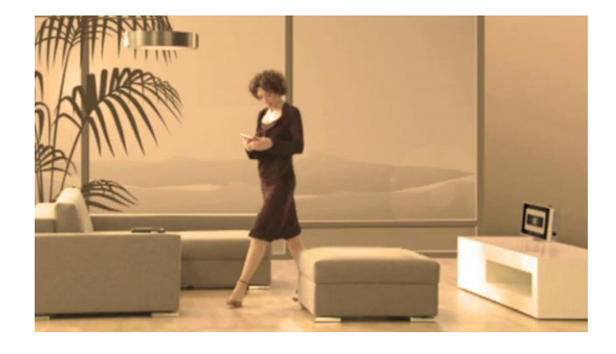
Figure 4 The 2006 Philips Streamium IFA home audio system

Existing meanings can be disposed of by selecting and deliberately not preserving them in