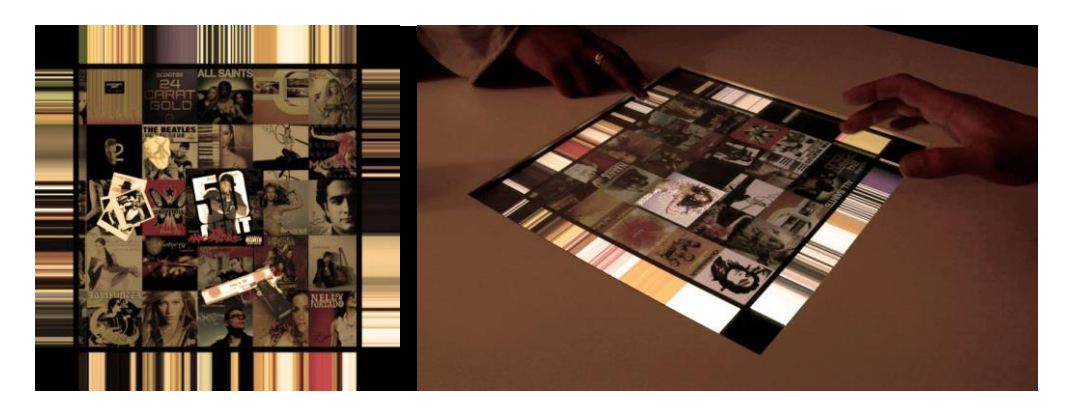
Figure 3 Example of a dynamic and interactive album cover: 50 Cent interactive album cover (left); The NAVA's multi-user interface (right)

Next to digital music content (digital audio), music context (information that one used to find in CD booklets and can now find on the internet) is represented by means of dynamic and interactive album covers. This enables fans to stay in touch and up to date with the artists, and artists to regularly express themselves and interact with their audience. Since the album or track content with regards to both music content and music context is dynamic and changing, the experience is always unique. See "Figure 3. Example of a dynamic and interactive album cover: 50 Cent interactive album cover (left)".