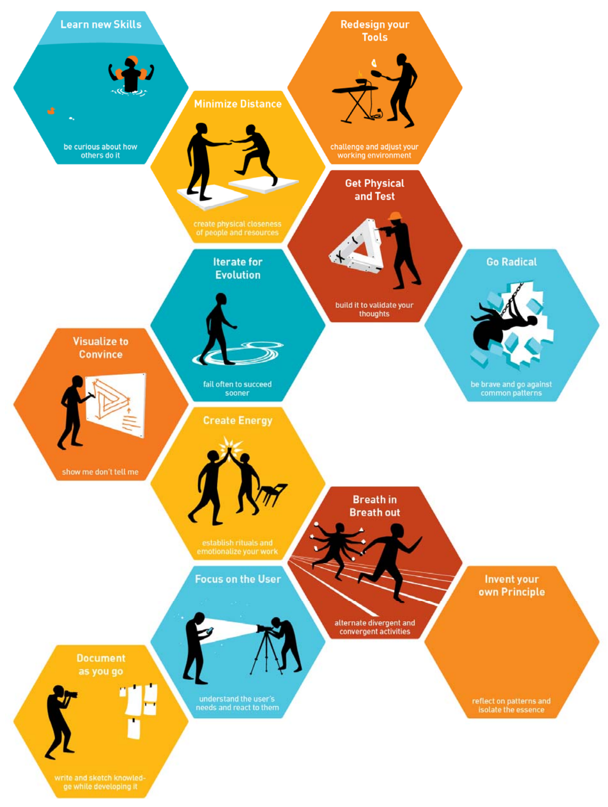
Figure 1. Principles for teams in NPD projects (12 examples)