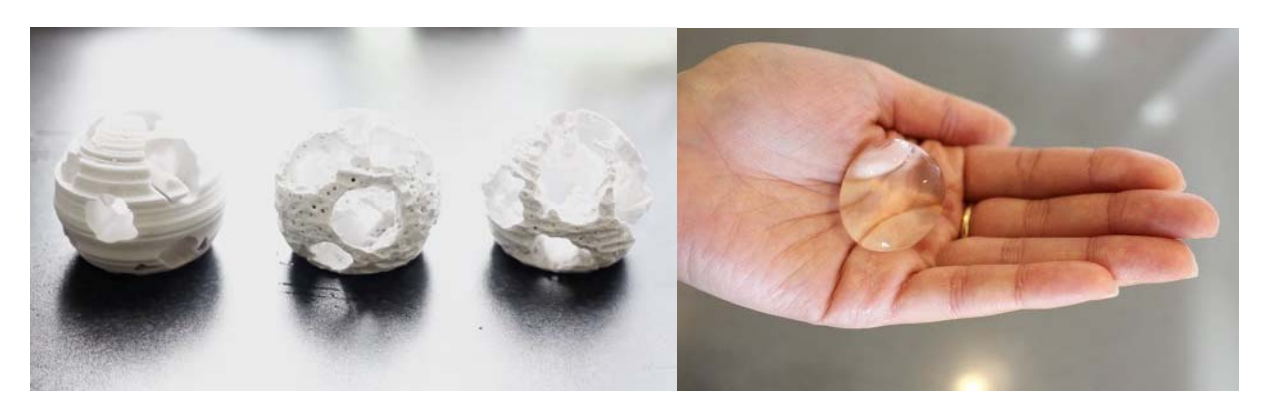
Figure 2. Coral3 by Nell Bennett - Figure 3. Ooho! by Paslier, Couche and Garcia Gonzalez