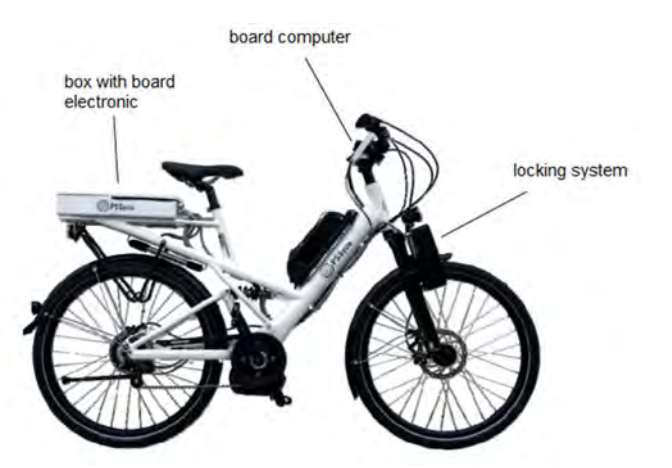
Figure 2. Pedelec with board computer, board electronics and locking system

A student sub-project within PSSycle aimed at developing a feasible locking system prototype for the e-bike that had to fulfill the following requirements: