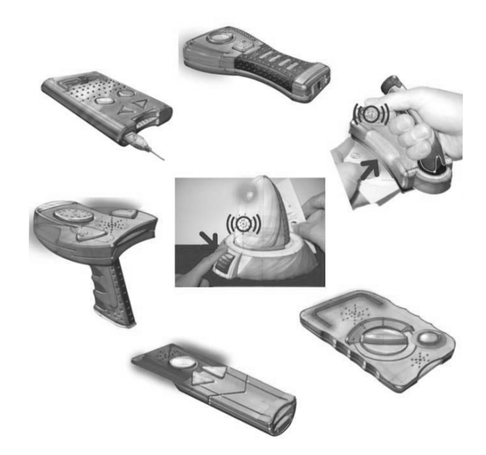
Figure 3. Shape explorations at concept development of an RFID-scanner with speech synthesizer.