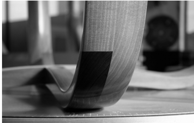
Figure 1. Producing curved sculptured forms using 'brick' lamination (c.Ancher 2009)

The changing role of the digital manufacturing within batch production is a topical research subject in furniture manufacturing, as illustrated by publications such as Furniture Makers Exploring Digital Technologies [6] and The New Furniture: how modern technology is changing the furniture and cabinet industry [7]. An example of Ancher's 'research through design' in this area is his recent development of a series exploring curved form making using digital technology. In this work, Ancher 'brick' laminated straight solid timber lengths, applying the desired curved, sculpted form through the use of digital technology, production-method CNC routing rather than hand shaping.