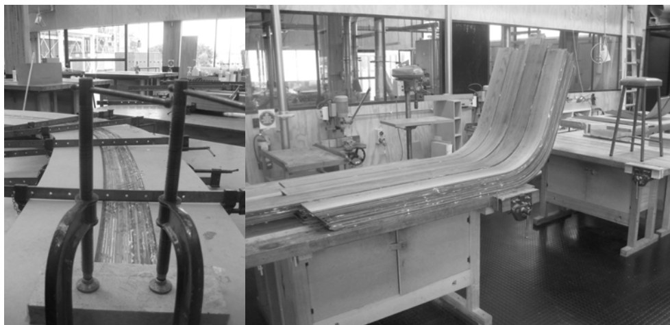
Figures 2 & 3. Larger forms with improved load bearing capacity (c.Ancher 2009)

Ancher utilised the curved form in a dining table leg structure to test it. He found that under load twisting and torsion movement was not absorbed by the form, dramatically reducing its structural integrity. The curved form, although laminated, which conventionally adds to the strength of the material, was weakened by shaping and was vulnerable at the exposed brick laminated joint. Due to the accuracy and efficiency in form generation opened up by the use of digital technology to create moulds and formers, Ancher found he could rapidly develop new manufacturing strategies and moulds that enabled a single flowing lamination, eliminating the problem and improving the design outcome.