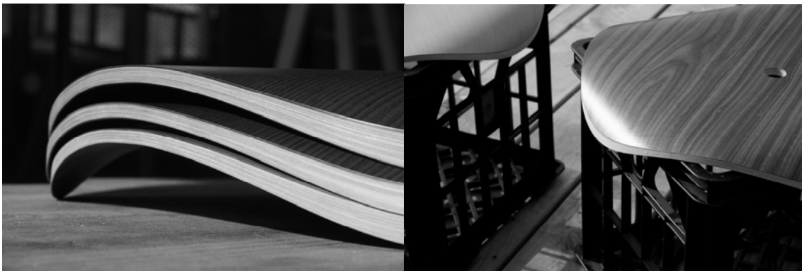
Figures 6 & 7. Refinished for revised target market (c.Ancher 2009)

On returning from Melbourne, Ancher discussed the feedback on the product with his students. Potential buyers had expressed sufficient interest in the idea for him to validate his decision to invest more time and money in developing the product further. It had also suggested to him that there was potential to raise the price bracket he was aiming for and increase the profit margin. The target market shifted from workers looking for casual, low cost seating, to design conscious, inner city mid-twenties to mid-thirties buyers looking for innovative storage that doubled as seating for casual living and nursery situations.