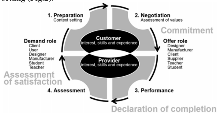
Figure 2. Atom of work: Rules of evidence and discourse model (based on F. Flores model [7])